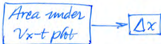
Diagram the relationship